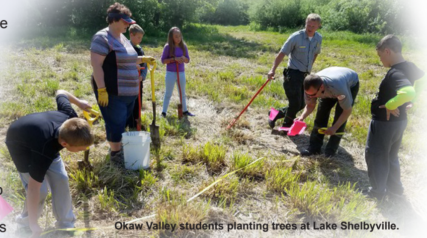
Okaw Valley students planting trees at Lake Shelbyville.